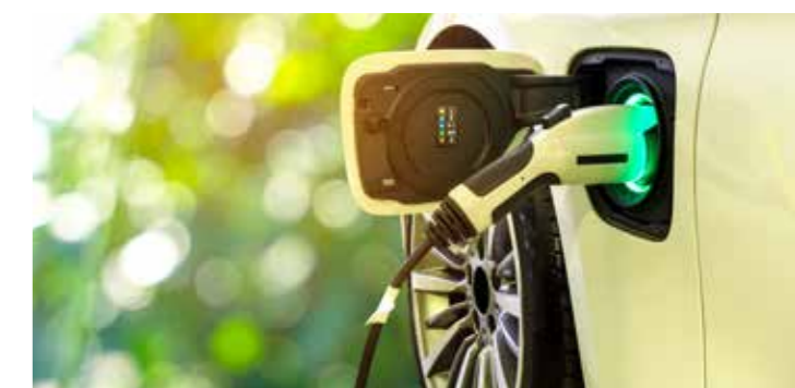
Images of the critical minerals value train showing exploration, processing and manufactured products including electric cars